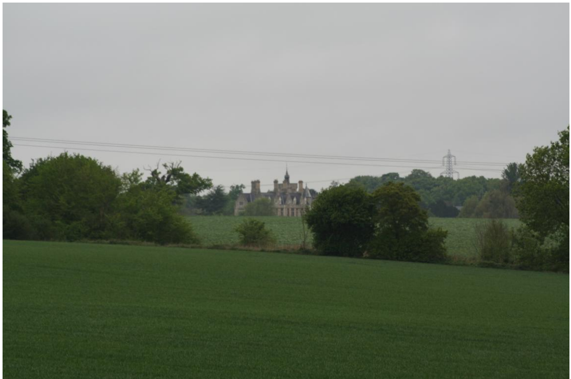
Landscape character, rolling countryside with views across it, in this case to Gilston Park and its historic landscape setting