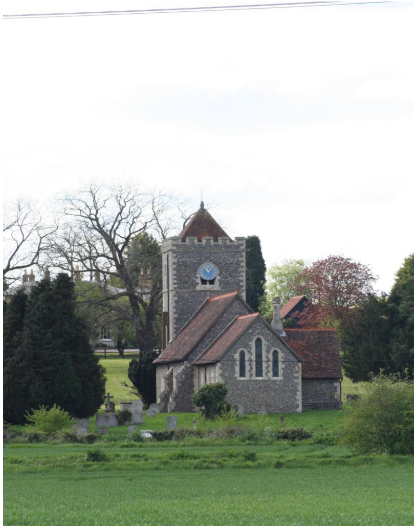
St Botolph's, Eastwick, a listed church within the village centre