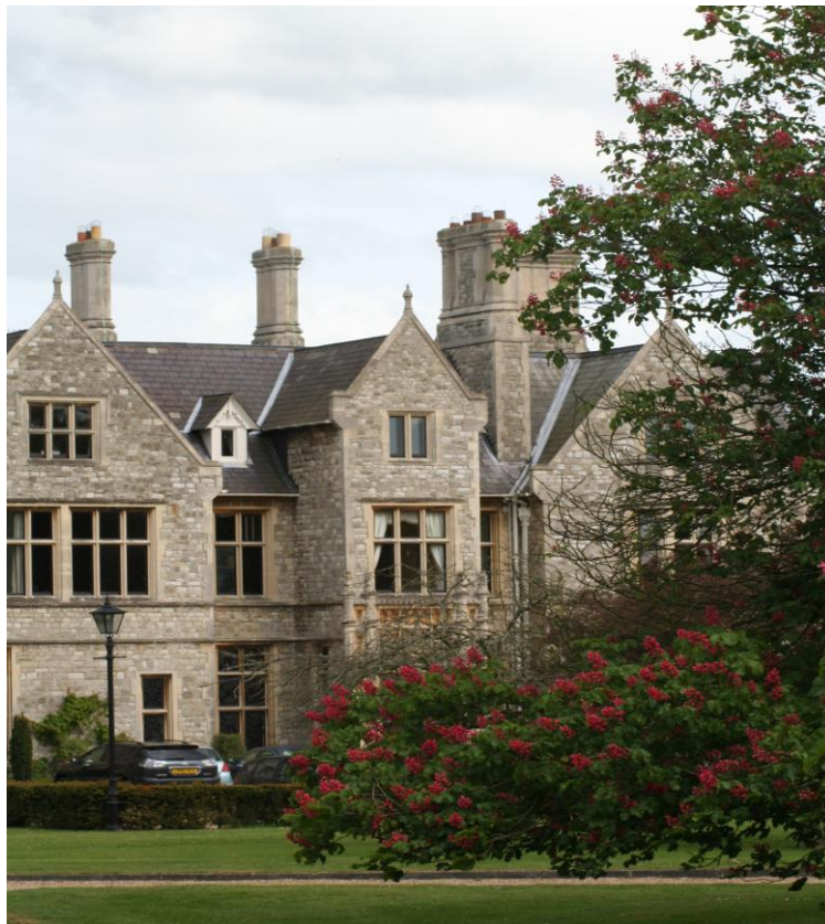
Gilston Park, a 19th century mansion whose owners did much to set the landscape quality of the parish as it exists today

Win EHDC's support for and undertaking of a 'housing needs survey'. The survey work identified slightly mixed aspirations for any new housing although seemed to accept that housing for local needs was needed and merited. There is a lack of any affordable and 'third generation' housing reflecting both the high values and Green Belt status of the majority of the parish. The first step is to undertake a more detailed assessment of demand and then consider the options from analysis of the survey outcomes; EHDC regularly conduct such surveys. ACTION Parish Council; via EHDC. SUGGESTED TIMING – 18 months.